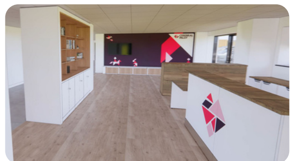
Screenshots from the virtual walkthrough of the proposed design for our children's centre