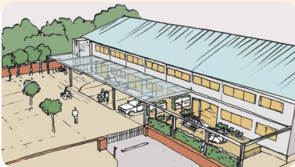
Artist's impression of our new children's centre in Llanishen, Cardiff